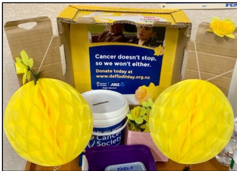
Our Daffodil Day Cancer Collection raised $192.30!!