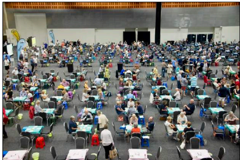
The Convention Centre has huge rooms for playing the bridge.

The two daily sessions start at a sensible 10.30 am which means you can go out for breakfast or a coffee beforehand. The afternoon session begins at 3.00pm so there is time to walk to a café for a leisurely lunch or if your accommodation is close enough, as ours was, 'home' it is. There is also a side event to enter in which teams explore the Congress chosen theme and create costumes. This year it was