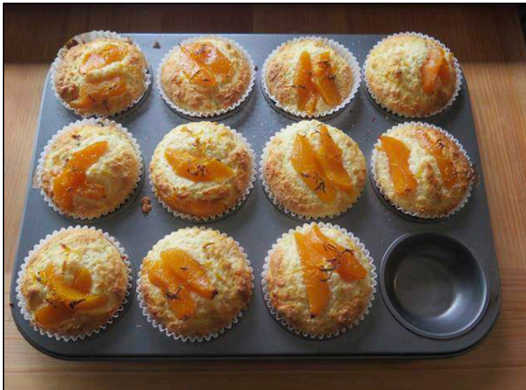
The sight of Barrie's Muffins kicked my salivary glands into action!

And yes I did make a dozen, but cooks privilege, had to test one!