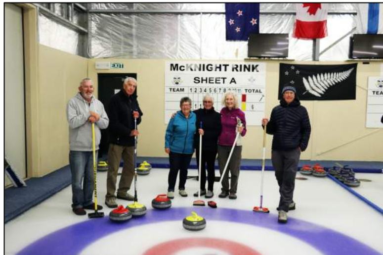
The highly skilled game of Curling, naturally won by the ladies!

This final day was the shortest and cruisiest ride, which suited us as we were heading to Dunedin later in the day. Virtually downhill all the way! So starting back at Hyde again we went past Straw Cutting where the tragic accident occurred in 1943, and stopped at a memorial cairn 50metres further on.