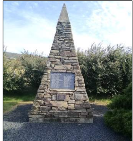
Left: Setting off from the Hyde Railway Station. Right: The monument to the 1943 Hyde train crash.

Finally an easy ride into the Strath Taieri valley and to the finish line (gate) in Middlemarch!